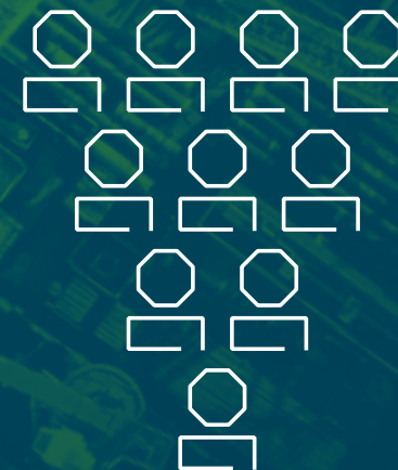
Typical Leadership Structure