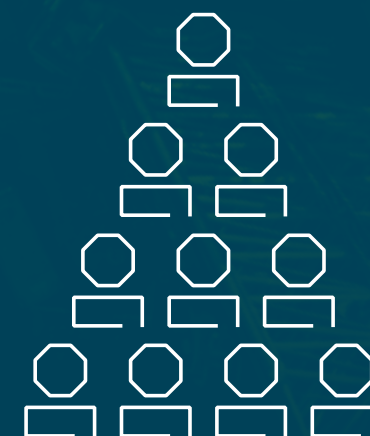
Typical Leadership Structure

We draw our organisation charts upside down, to reflect our belief that leadership's role is to serve the business and to devolve power as close to the coal face as possible. By implementing this model, we multiply the leadership capability of the organisation, increase human potential and serve our customer better than our competition. We believe in facilitating excellent relationships between end-users and suppliers. From the positive feedback we receive, we know this important philosophy is highly valued by our clients. We thrive on the professional satisfaction of meeting the ever-changing challenges of the international energy industry and other sectors in which we operate.